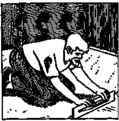
Prepare a smooth surface