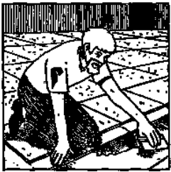
Spread the glue