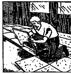
Turn tiles over