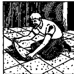
Glue the tiles down